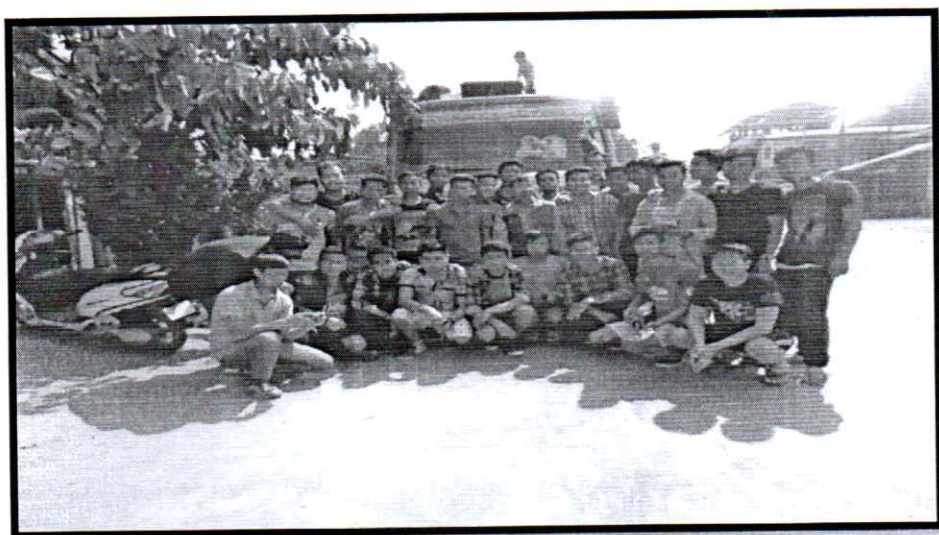
Photo-1. Group photo with Teacher in Charge at Ukhrul on 06-04-2022

The total number of students participated in the field work was 76 (Seventy Six) of 44 female and 32 male students of B.A./B.Sc. 6 th Semester Honours Course.